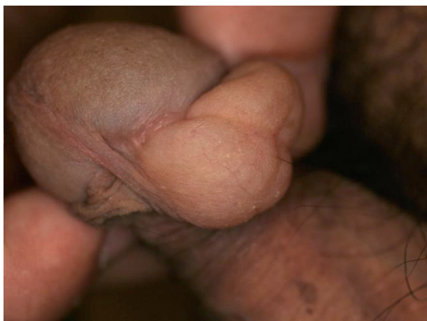
Fig. 1. A soft cystic nodule on the ventral aspect of the penis. The glans is seen to the left side and the rest of the penis is down to the right side. The nodule is cross at the frenulum.

Histopathological examination showed an irregularly shaped empty cystic space in the middle dermis (Fig. 2a). No connection with the epidermis was evident. The cyst wall was lined with pseudostratified ciliated columnar epithelium (Fig. 2b). An immunohistochemical study was performed using a standard avidin-biotin peroxidase method. The luminal cells at the apical border were positive for CK7 (Fig. 3a), carcinoembryonic antigen (CEA) (Fig. 3b) and epithelial membrane antigen (EMA). No positive staining was obtained in the epithelium by CK20, \alpha -smooth muscle actin ( \alpha -SMA), anti-S100 protein and