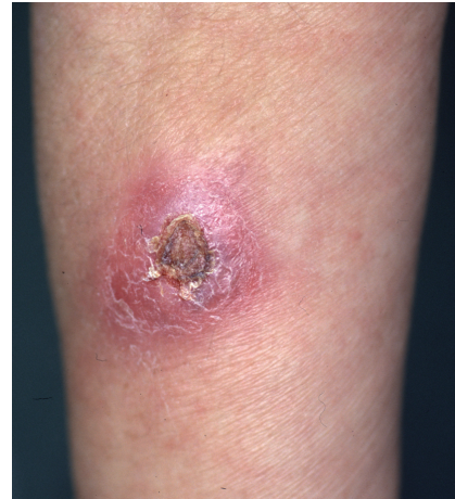
Fig 1. Erythematous indurated lesion with ulcer on the left forearm.

as having both cutaneous and pulmonary tuberculosis. Infliximab was discontinued immediately; quadruple anti-tuberculosis therapy, comprising isoniazid, rifampicin, pyrazinamide and ethambutol, was started. After 5 months of anti-tuberculosis therapy, the cutaneous lesion gradually resolved and pulmonary lesions cleared.