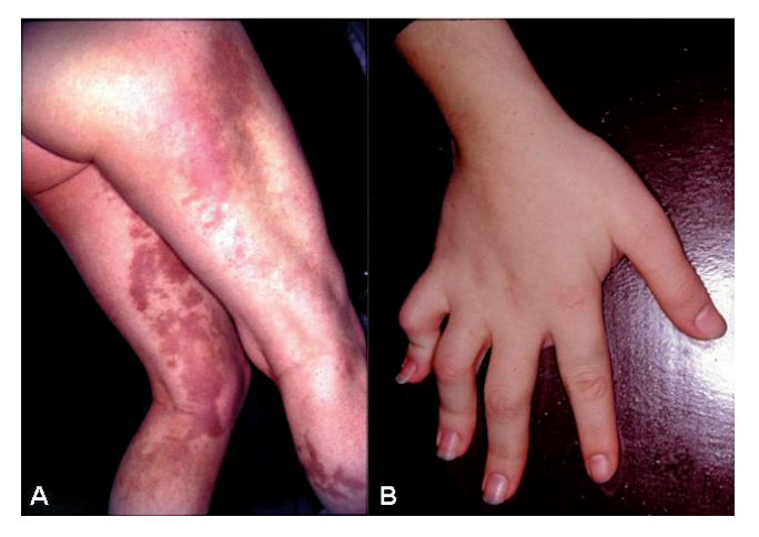
Fig. 2. (A) Hyperpigmentation of the lateral sides of the legs. (B) Distortion of the fingers.

On the basis of the history and laboratory investigations the hyperpigmentation was attributed to vitamin