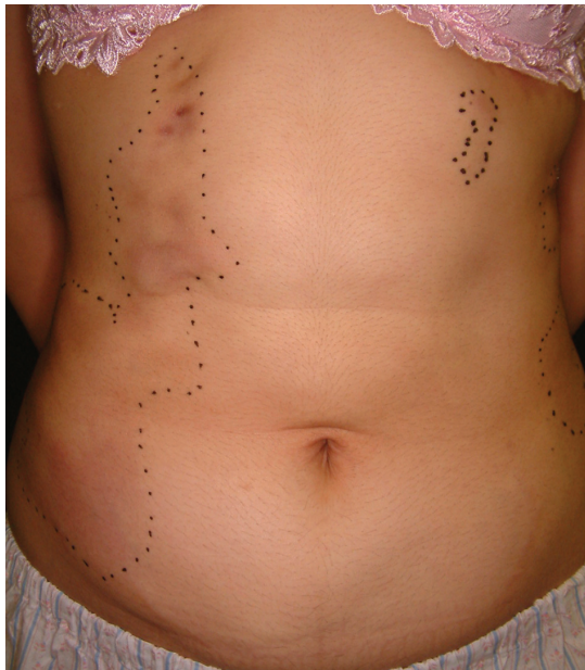
Fig. 1. Clinical photograph on admission (6 months after the onset of the disease). Multiple subcutaneous abscesses on both sides of the abdomen (dotted lines). The largest was on the right side, measuring 20 × 8 cm.

A 25-year-old Japanese woman presented with a 6-month history of painful indurated nodules on the abdomen. She was otherwise well with no history of general malaise or weight loss. Initially, the lesions appeared on her left abdominal wall and 3 months later, they had increased in size and were present bilaterally (Fig. 1). Cutaneous examination revealed multiple indurated nodules, the largest measuring 20 × 8 cm. She was afebrile