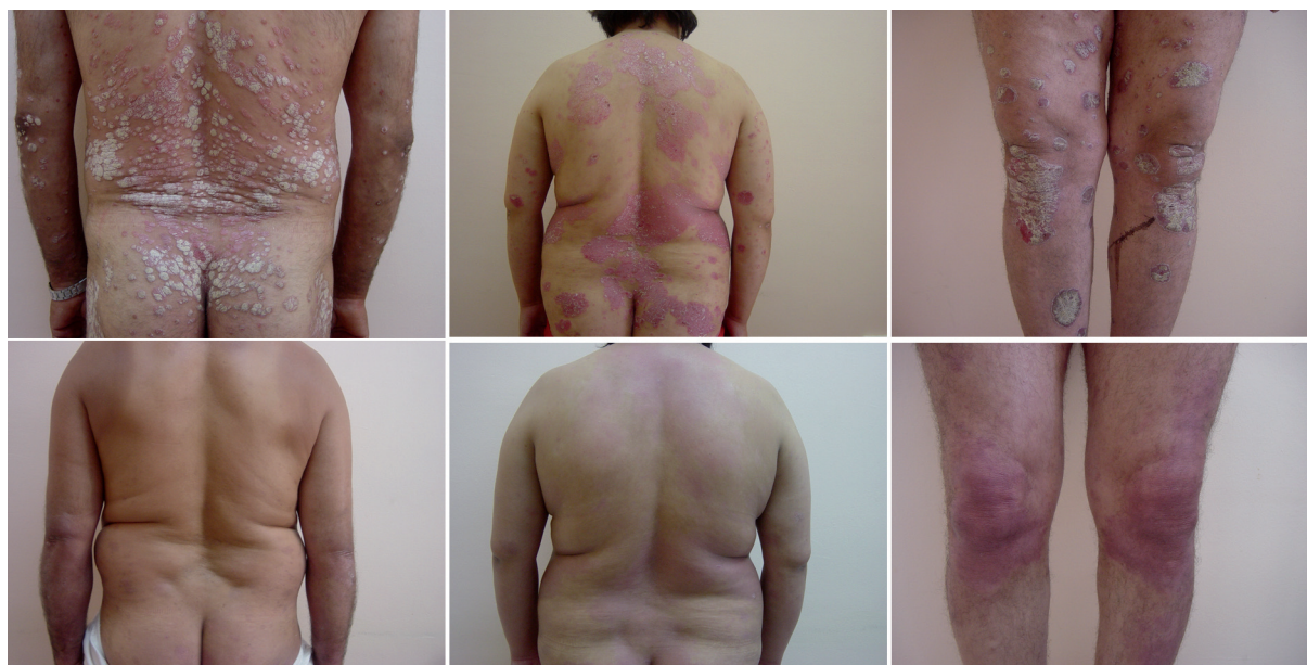
Fig. 3. Three patients before (upper panel) and after (lower panel) acitretin-narrow-band TL-01 (re-TL-01) treatment. The post-treatment photographs were taken after 8 weeks.