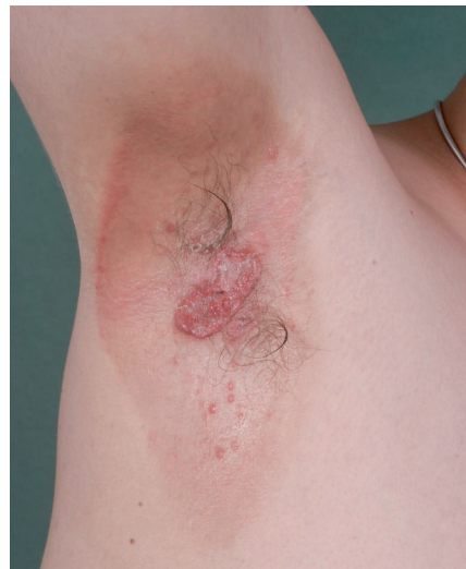
Fig. 1. Nodular, suppurating lesions in the axilla surrounded by erythema and papulopustular lesions.