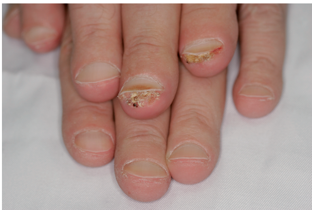
Fig. 1. Hyperkeratosis-like deposits under two fingernails.

The patient had been diagnosed with end-stage renal disease 18 years before and had undergone three kidney transplantations. The first one had been performed 15 years previously and the patient had retained the graft for 8 years. He had received a second graft 3 years after removal of the first one, but his body rejected it within a month. A third transplantation had been performed 11 months prior to his presentation at our clinic, since which he had been receiving tacrolimus (2.5 mg/day) and methylprednisolone (6 mg/day). The patient had displayed hyperoxaluria since his last transplant operation. A recent urinary analysis showed urine oxalates of 93 mg/day