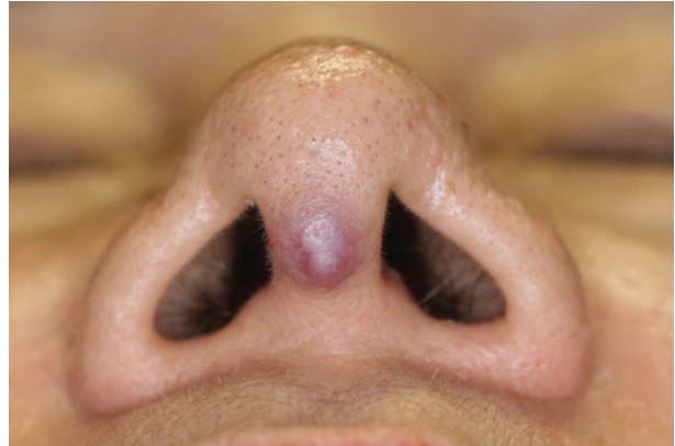
Fig. 1. An asymptomatic, 0.5 cm-diameter, blue-red, dome-shaped nodule on the tip of the nose.

A 68-year-old woman presented with an asymptomatic, 0.5 cm-diameter, blue-red, dome-shaped nodule on the tip of her nose (Fig. 1). The lesion had grown slowly for the last 3 years. She had been diagnosed with rheumatoid arthritis 40 years previously and she had been taking medication that included methylprednisolone, hydroxychloroquine and methotrexate. Histopathological examination showed variable numbers of vascular channels that were elongated and displayed prominent branching (a stag-horn appearance) (Fig. 2A). The tumour cells resembled glomus cells with round and ovoid nuclei arranged in short fascicles around thin-walled vessels (Fig. 2B). There was no cytological atypia. Immunohistochemically, the tumour cells stained for smooth muscle actin (Fig. 2C) and vimentin. CD34 immunoperoxidase staining only decorated the endothelium of the vessels, but the perivascular concentric myoid cells were not immunoreactive (Fig. 2D). They did not stain for desmin. On the basis of the histological findings, the tumour was diagnosed as a glomangiopericytoma. The patient underwent successful surgical excision, with no recurrence in the 8 months following the excision.