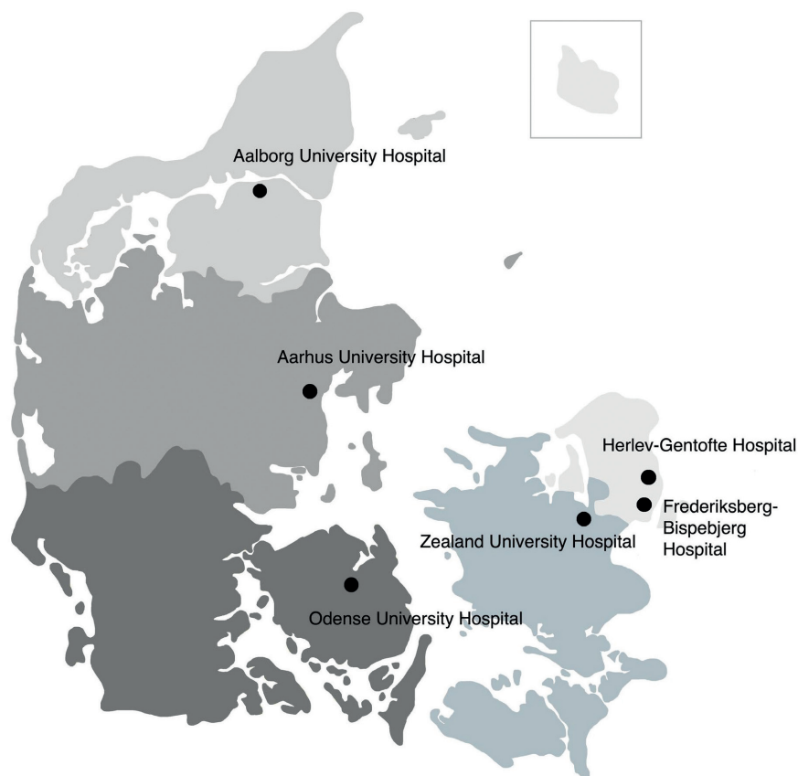
Fig. S1. Dermatology departments in Denmark.