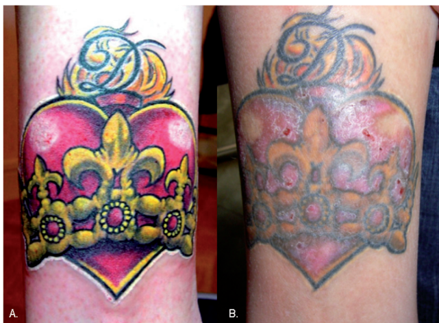
Fig. 1. (A) The fresh ankle tattoo immediately after the last tattooing session 18 months previously (the colour brightness is due to the presence of pigments in the epidermis). (B) Tattoo reaction after 18 months, with infiltration and exulcerations.

We report here an unusual and severe “scleroderma-like” reaction after tattooing, which was restricted to the red parts of a tattoo. Symptoms of hypersensitivity reaction to tattoo pigments are often non-specific, including discomfort, swelling, papules or nodules and pruritus (5). Clinical induration is not an uncommon manifestation of tattoo reactions (5), but the