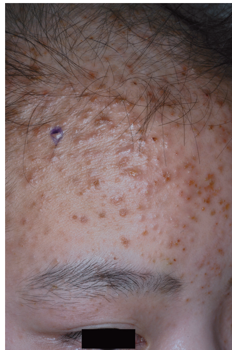
Fig. 1. Clinical finding of follicular reddish papules with occasional pustules on the forehead.

for atopic dermatitis. A follow-up examination one year later demonstrated occasional recurrence of the skin lesions.