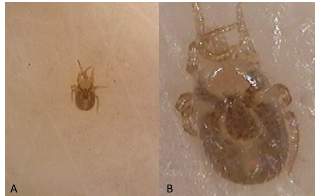
Fig. 2. (A) Dermoscopic aspect (×30) of a mite from the patient’s back. (B) At high magnification (×150) the mite appears red-brown in colour with 4 pairs of limbs, and an ovoidal body engorged with blood.