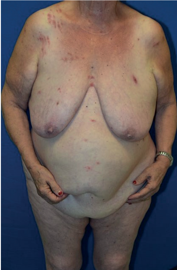
Fig. 1. Clinical examination showing itchy purpuric excoriated macules and papules on the trunk.

What is your diagnosis? See next page for answer.