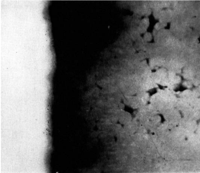
Fig. 2. Microradiogram of the same section as Fig. 1 showing interglobular dentin in the neighbourhood of the dentino-enamel junction ( \times 100 ).

axes of the dentinal tubules are analyzed with a microradiographic technique.