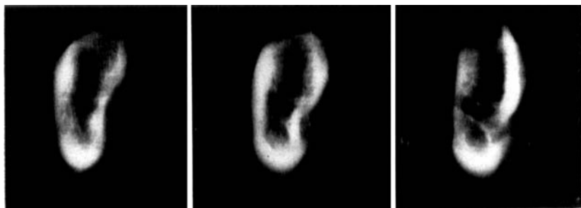
Fig. 1. Three simultaneous tomogram sections of a mandibular body.