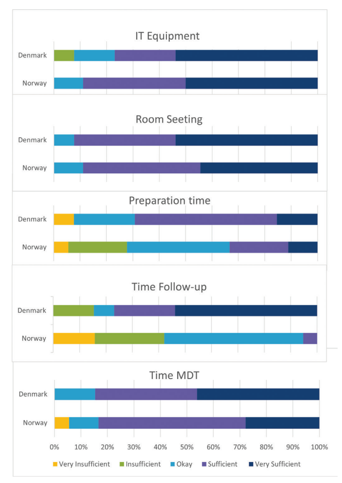
Figure 1. Results from national surveys on IT equipment, room/setting, preparation time, time for follow-up and allotted time for MDT meeting. Options were: very insufficient, insufficient, okay, sufficient and very sufficient.

MDT-MODe observations were collected from 69 patient cases presented at the respective MDT's, 47 from Denmark and 22 from Norwegian 'regional' MDT during a total of 6 MDT meetings. Table 2 shows summary of participants and number of cases at each MDT meeting. Mean time spent per case was 5 min and 5 s. Table 3 shows at which point of care the patient was discussed and Table 4 the percentage of cases, where treatment