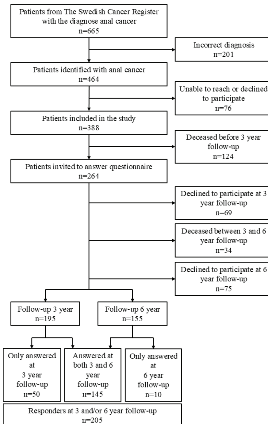
Figure 1. Flowchart ANAL Cancer-study.

The primary outcome was QoL, dichotomised as low or high . The key exposure variable was perception of being cured, modelled as a categorical variable with four levels: not at all sure , somewhat sure , moderately sure , and very sure . We used a mixed-effects logistic regression to analyse combined data from 3- and 6-year follow-up.