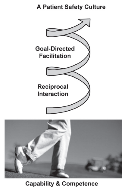
Fig. 2. Overview of the core elements in the staff interactive approach, based on 2 (metaphoric golfer's) legs; the "standing leg" of the team's assembled professional competence and the "driving leg" of their capability (i.e. the ability to use competencies in new and complex situations, focusing on the future), which together, in a staff interactive process are directed towards a 3-phase development of: reciprocal interaction, goal-directed facilitation and a patient safety culture, focusing on fall prevention.

The basis of the implementation of the fall preventive strategies summarized in Fig. 2, is 2-fold. On the one hand, this process is based on the staff's specific professional competence built on a foundation of basic skills, scientific knowledge, and ethical development (44), and on the other hand it is dependent on